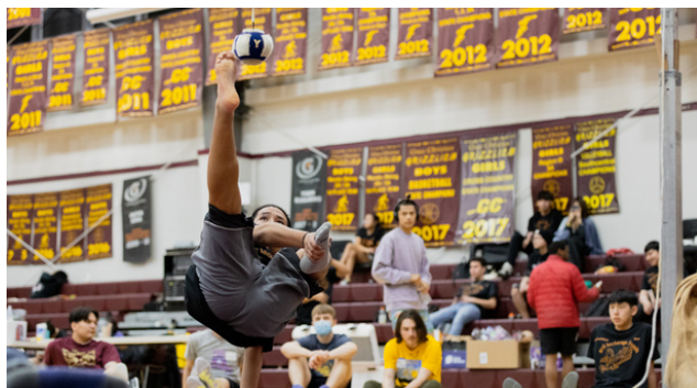
An athlete competes in the Alaskan High Kick during the 2023 Anchorage Tryouts.