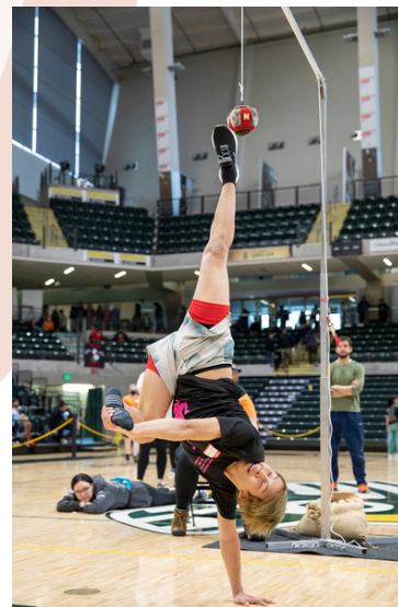
The kickstand is an iconic piece of NYO equipment. NYO equipment kits will include a lightweight, collapsible kickstand and additional items that support practice of the Games.