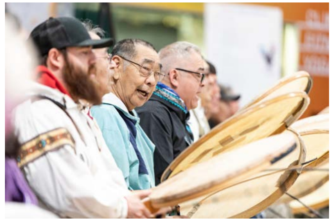
NYO celebrates Alaska Native culture through traditional games and other cultural activities.

Today, the Games ensure that Alaskan youth of all backgrounds learn essential skills for traditional Alaskan subsistence activities that still occur today. Both JNYO and SNYO bring together athletes to compete against their peers, but most importantly, to compete against who they were yesterday.